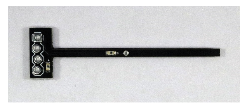
Figure 2- Da Fingah

reference sensor will not be shaded by the rolling stock to be detected by the under-track sensor. You can also use discrete photo transistors, or IR photo transistors and emitters. Our standard discrete photo transistor is the PT-19 which looks like a 3mm LED. Use two for each circuit, one for reference and one for detection.